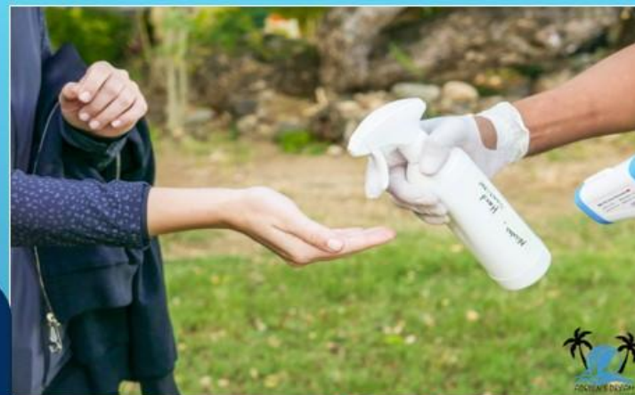
Safety Protocole 2

Adrien's Dream has had the pleasure of welcoming its first clients, post Covid-19