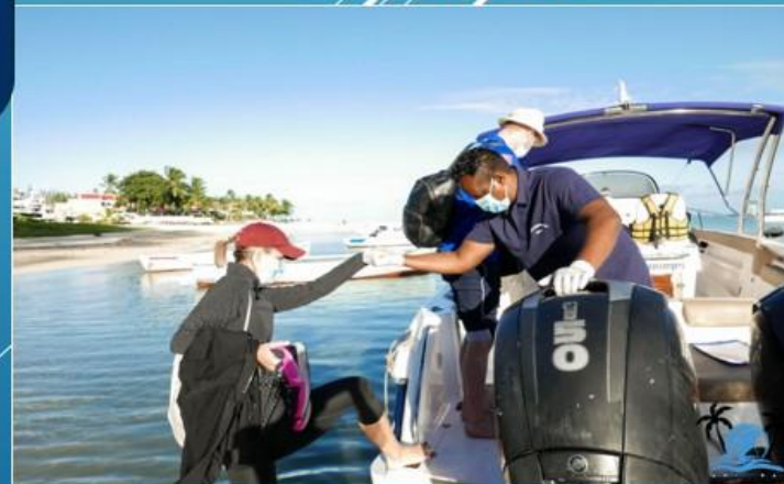
Safety Protocole 4