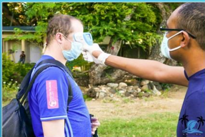
Safety Protocole 1